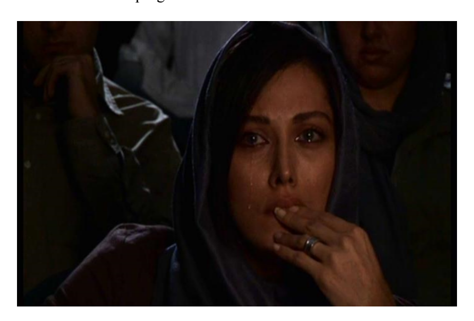
Fig. 3 The actresses' connection to the story resonates through their emotional expressions. (Film still from Shirin )

As the female look becomes active in Shirin , the fetishization of the female body fades away. Regardless of the static impression assigned to the close-up and the closeness of the female body to the audience, which might provoke the implication of possession and fetishism as is the case in classical Hollywood cinema (roughly from 1917 to 1960), the close-ups of Shirin work towards subjectification of the female body rather than its objectification. The women in the film are introduced to us, from the beginning, in close-up shots and throughout the film their proximity to us remains immutable. The close-up shots, therefore, do not break the female body; rather, they dominate it. In fact, it is mainly through these close-ups, and through the look and