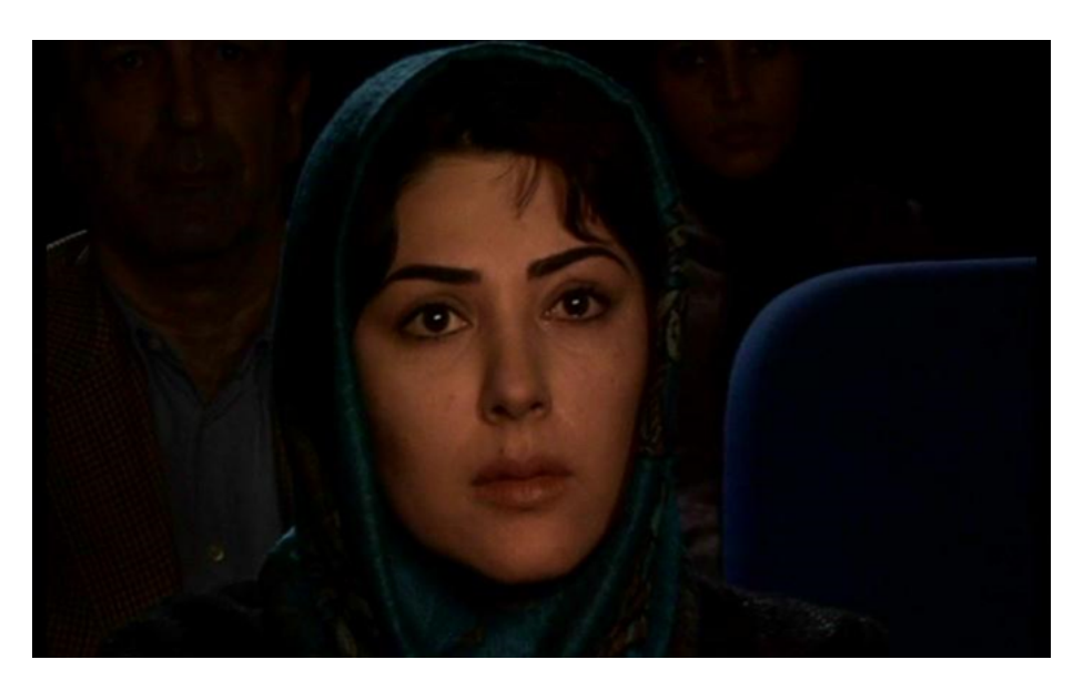
Fig. 2 Male spectators are not visually emphasized in the film. (Filmstill from Shirin (Kiarostami, 2008))

In Shirin , the four looks of the cinematic apparatus are interwoven complexly into two main categories. The looks of the camera, the audience, and the imaginary other collapse into one look, and the look of the characters becomes the only one standing on its own. However, the characters' gaze is only definable through its interaction with the other three, or the one integrated look. Therefore, the gaze of the female audiences is aligned with the female imaginary look, and both are in interaction with the look of the female characters. What happens here, then, is the domination of the female gaze throughout the film. Although there are some male spectators in the auditorium in the film, they are always in the darkness, in the background, and mostly out of the frame (See Fig. 2).