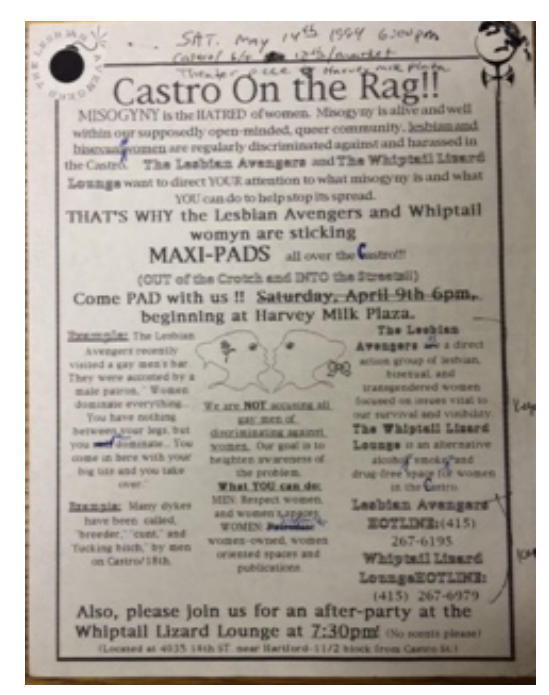
Fig. 4 (Left) Flyer for Lesbian Avengers Fundraiser.

Fig. 5 (Right) Flyer for "Castro on the Rag" event.