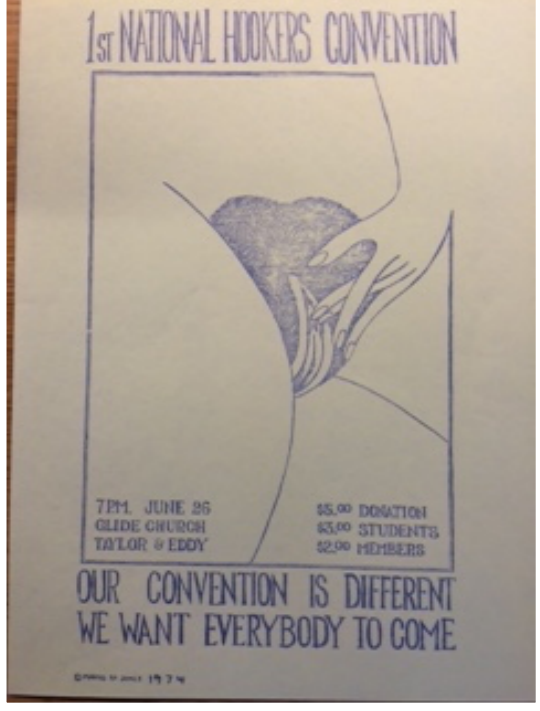
Fig. 2 Flyer for 1<sup>st</sup> National Hookers Convention, 1974.